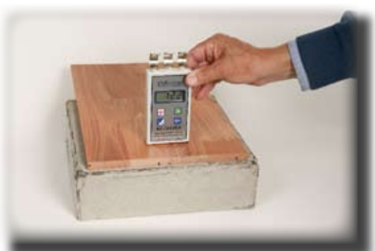
Scanning Depth 10 mm - Measures only the Wooden Floor