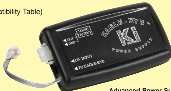
Advanced Power Supply