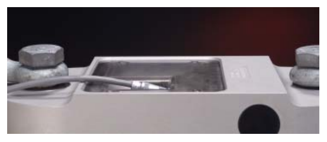
Small details improve durability. The EDxtreme features a recessed connector and embedded antenna to help prevent damage from snags that commonly disable other instruments.

Specifications and dimensional details are available from an authorized Dillon Distributor or the website at www.dillon-force.com.