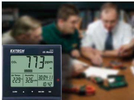
Desktop Carbon Dioxide (CO 2 ) Meter monitors the air quality in conference rooms insuring proper air ventilation