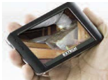
Detachable wireless 3.5" color TFT LCD display can be viewed from a remote location up to 32ft (10m) from the measurement point.

Complete with 4 AA batteries, rechargeable display battery, microSD memory card with SD adaptor, USB cable, extension tools (mirror, hook, magnet), video interconnect cable, AC adaptor (100-240V, 50/60Hz), magnetic base stand, and hard case