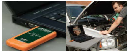
BRD10 - Optional Wireless USB Video Receiver allows user to stream live video to a PC and also can be remotely viewed via VOIP connection