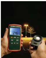
High resolution for low level measurements in places like parking lots, stairwells, and ATM machines